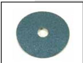
Sanding Discs 129