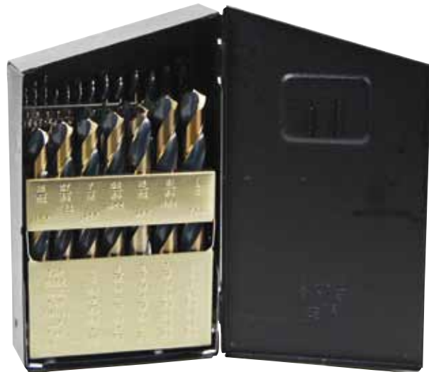
F-49647 or F-49649