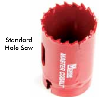
Standard Hole Saw