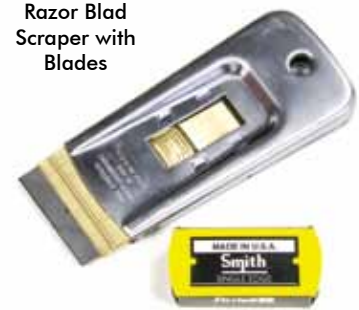
Razor Blade Scraper with Blades