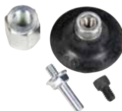
ROLOC DISC HOLDER