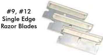
#9, #12 Single Edge Razor Blades