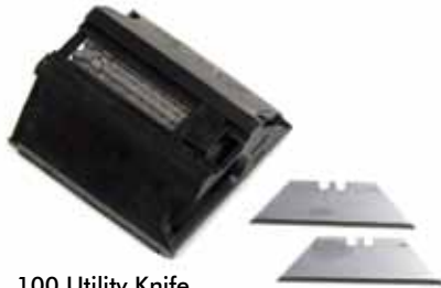
100 Utility Knife Blades w/ Dispenser