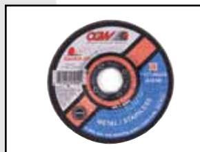
Cutting and Grinding Wheels 131- 132