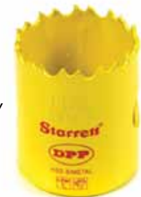
Starrett Hole Saw