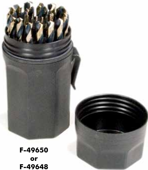
F-49650 or F-49648